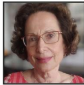
Author, Journalist and Columnist Bachi Karkaria