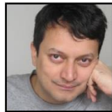
Poet and Cultural Theorist Ranjit Hoskote