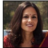
Poet, Novelist and Dancer Tishani Doshi

DATE: THURSDAY, 18 MARCH '21 TIME: 6:00 PM - 7:30 PM (IST) REGISTER: www.avidlearning.in